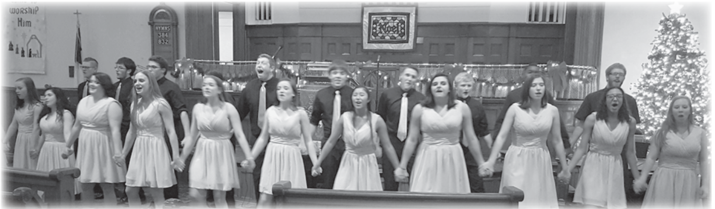
The Hornell High School Select Choirs entertained at DAHS's December program held at the Presbyterian Church. Donations received went towards the choir's upcoming trip to Chicago this coming spring.